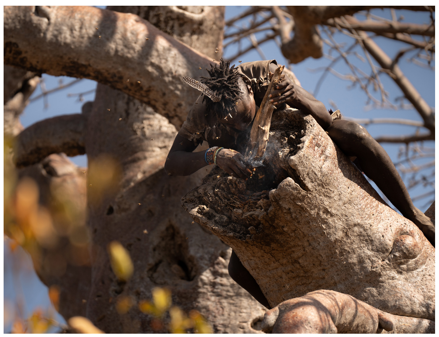
Honey is an exceedingly important food source for the Hadza hunter-gatherers of Tanzania. The honey (ba'alako in Hadzane) produced by the African honey bee (Apis mellifera adansonii or awawa in Hadzane), is coveted but requires great skill and daring to secure. These bees typically make hives high in the hollow trunks and limbs of baobab trees (Adansonia digitata) and fiercely defend against intrusion. Without the ability to make fire (for smoke) and climbing pegs to reach the hives, raiding their caches would be a deadly proposition.