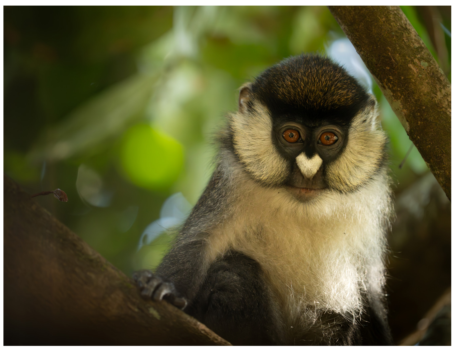
Following an hour of hiking in the morning darkness of Issa Valley (Tanzania), we arrive at the coordinates where the research team observed the troupe of Red-tailed monkeys (Cercopithecus ascanius) nesting last night. As daylight approaches, the silence of the miombo woodland is pierced by the sudden careening of the monkeys leaping from branch-to-branch and tree-to-tree in search of food and in play. Occasionally, they contain their frenetic energy long enough to capture their piercing eyes and inquisitive expressions. Red-tailed monkeys are one of over thirty species of cercopithecines found only in Africa.