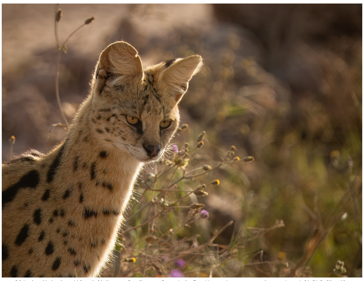
Safari trucks rumble along the arterial dirt roads of the Ngorongoro Crater (Ngorongoro Conservation Area, Tanzania), transporting passengers across the preserve in pursuit of the "big five." Meanwhile, a serval cat (Leptailurus serval), a solitary (and normally nocturnal) hunter found across sub-sahara Africa, waits along side a road to pounce on mice flushed out by the commotion of the oncoming tires.