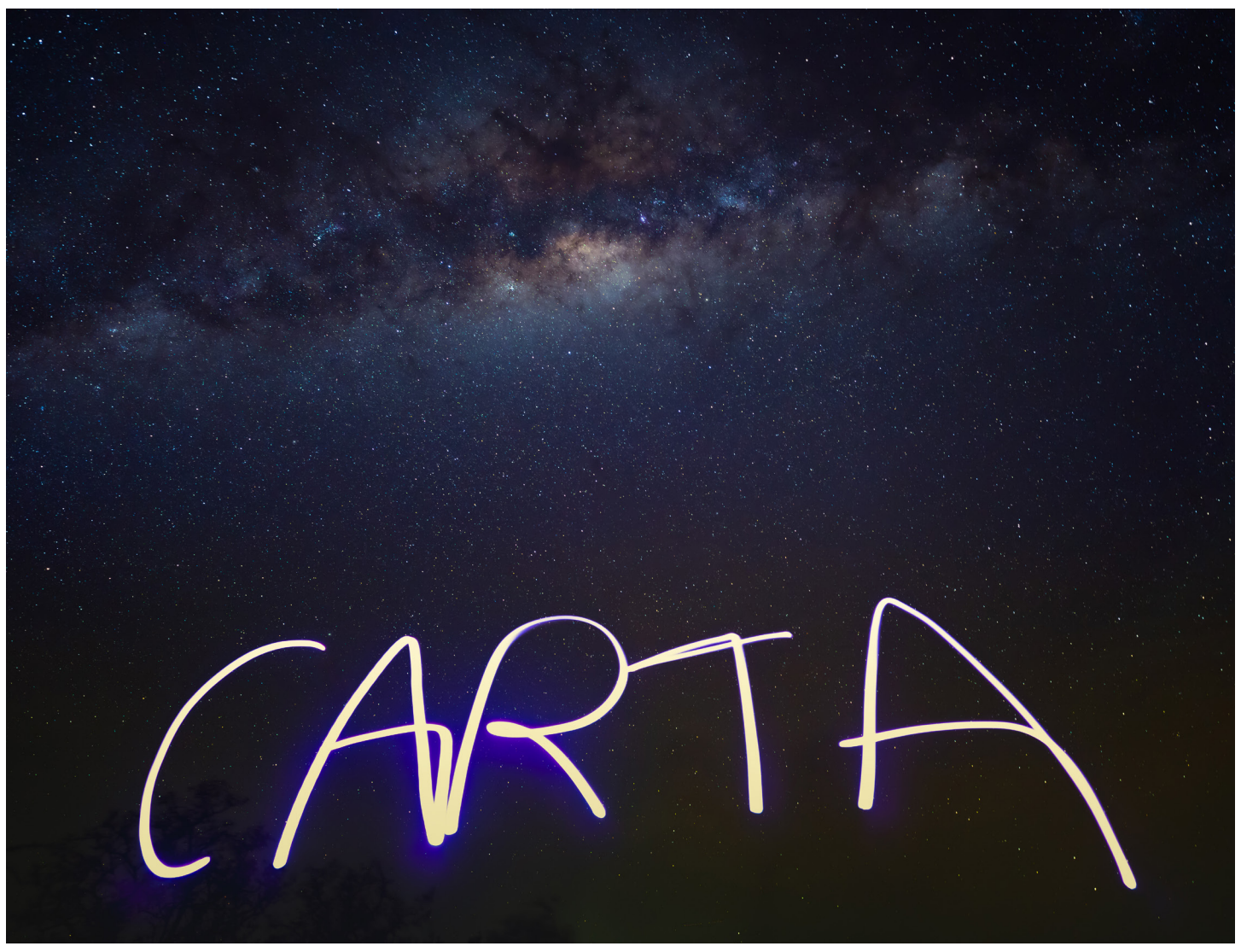
The view is a profound shock to those unaccustomed to the night sky not occluded by artificial light pollution. At Yaeda Valley (Tanzania), the evening ocean above teams with effulgent stars swimming in the vibrant waves of the Milky Way. The astral scenery is also perfect for practicing light-painting the name of one's favorite human origins research organization.