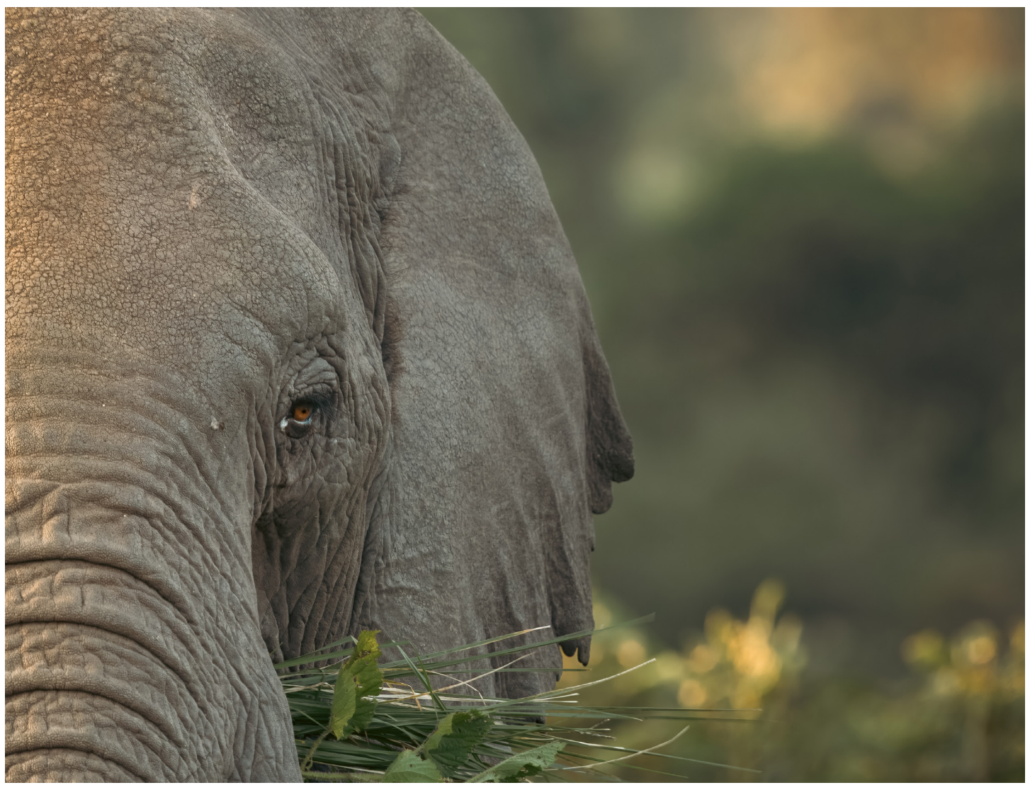
The ascent of the Ngorongoro Crater (Ngorongoro Conservation Area, Tanzania) is steep and winding, made via a road carved into the precipice of the crater rim. Upon cresting the formidable slope, golden rays of late afternoon sun illuminate the grassy garden from which grazing elephants (Loxodonta africana) contemplate our trespass through its home range.