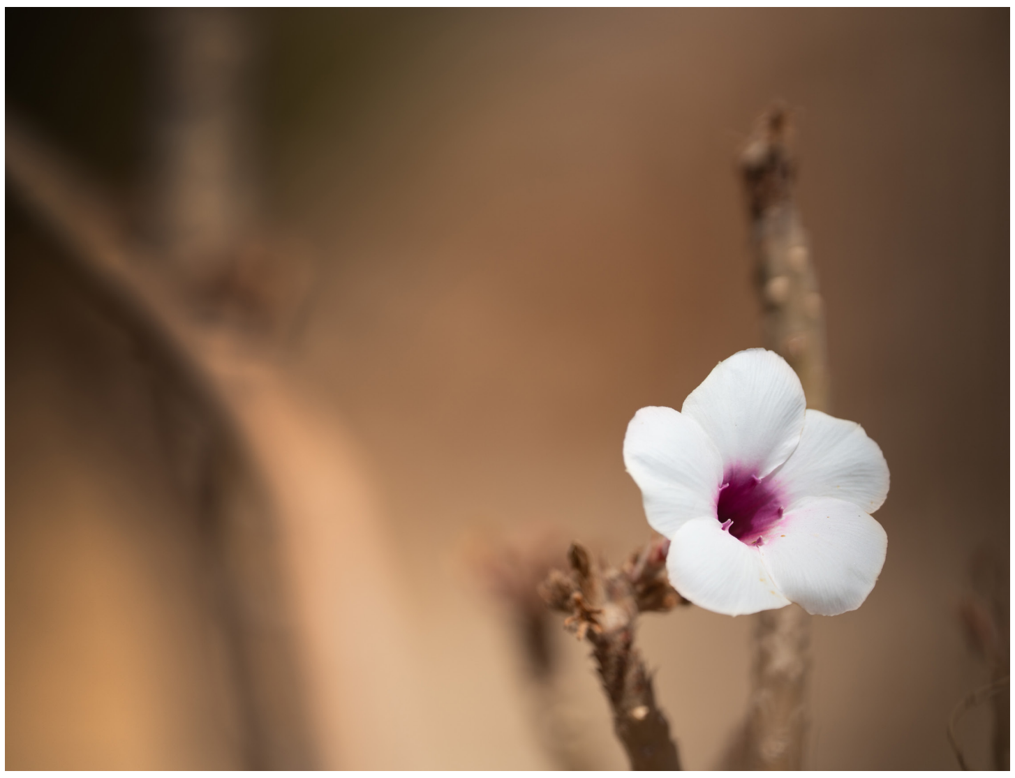
The height of midday sun beats down on the parched, cracked bed of the receded Lake Eyasi at a site called Maji Moto (Swahili for hot water ). Nearby, white and pink flowers sparsely decorate the skeletal tendrils of desert rose ( Adenium obesum ), providing the only splash of color in the otherwise sepia landscape. The pulp of the desert rose plant is processed by the Hadza hunter-gatherers to make a potent arrow poison (a cardiac glycoside) for which there is no known antidote.