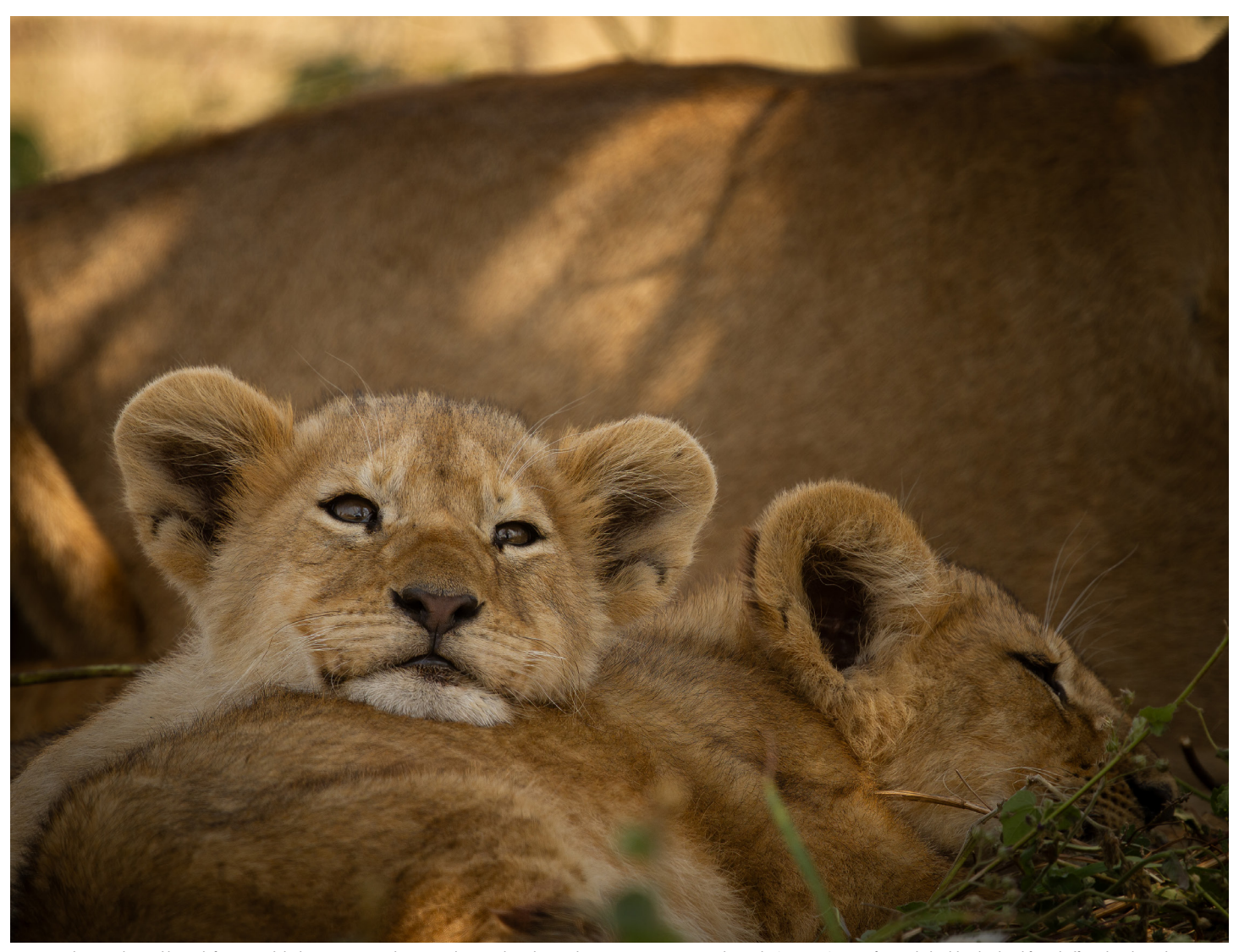
The CB radio crackles with frantic Swahili, the intercom interlocutor exclaiming that a lion pride is near our position at Ndutu Lake (Tanzania). Our safari truck shudders back to life and off we dart through the marsh toward the hillock we are directed. Under the shade of an acacia tree we find lion cubs in repose, their soft, social, salubrious kitten cuddle but a small snippet of the large pride. In fact, a mere ten meters away, numerous adult lions engage in feast of giraffe – a reminder of the polarity of life and death on the savannah.