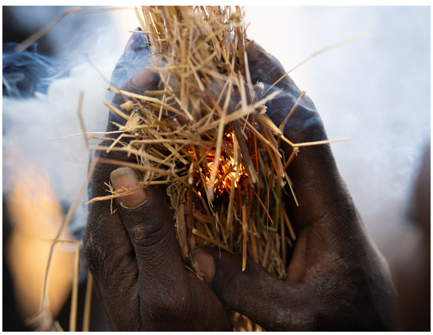
The intimate connection between the evolution of humanity and the ability to harness and control fire is much like the metaphorical dilemma of "the chicken or the egg." Was our lineage already along the path toward the suite of features that now define us, with fire-making ability as a logical consequence, or did fire serve to spark radical augmentations of the body and brain? Today, it is impossible to imagine humans without the ability to control fire. For the Hadza hunter-gatherers of Tanzania, fire is an essential survival element and they are famous for lighting friction-fires in less than one minute.