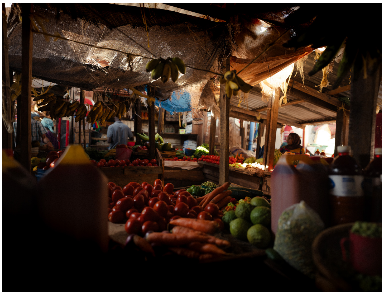
One of the many joys of the local Tanzanian markets are the stands of fresh produce. At the Kigoma market, a vibrant selection of fruits, vegetables, and other cooking necessities are on offer. Friendly haggling over price is expected, and if one seller doesn't have what you want, another will suddenly materialize with goods in hand. The sellers work together to secure business and settle their accounts after you've left.