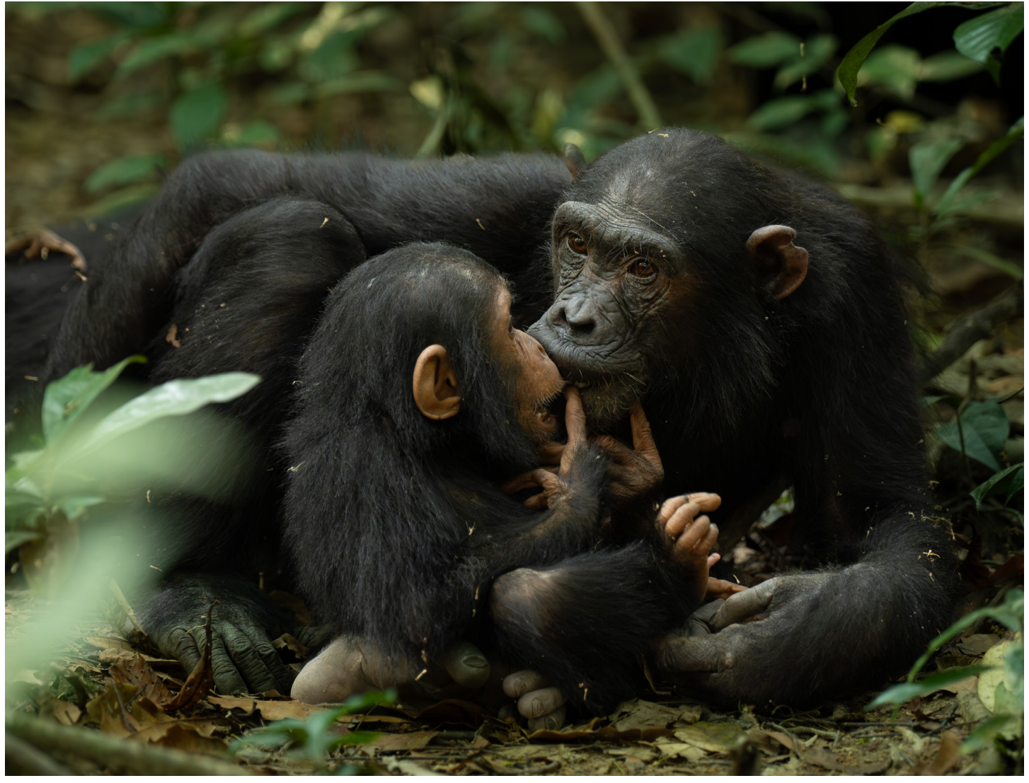
The morning air, heavy with humidity and the musty odor of decay, filters through the jungle curtains of the Mahale Mountain National Park (Tanzania) as a juvenile and an adult chimpanzee embrace on the forest floor. In moments such as these, it is easy to see our shared ancestry with chimpanzees despite 6–9 million years of independent evolution.