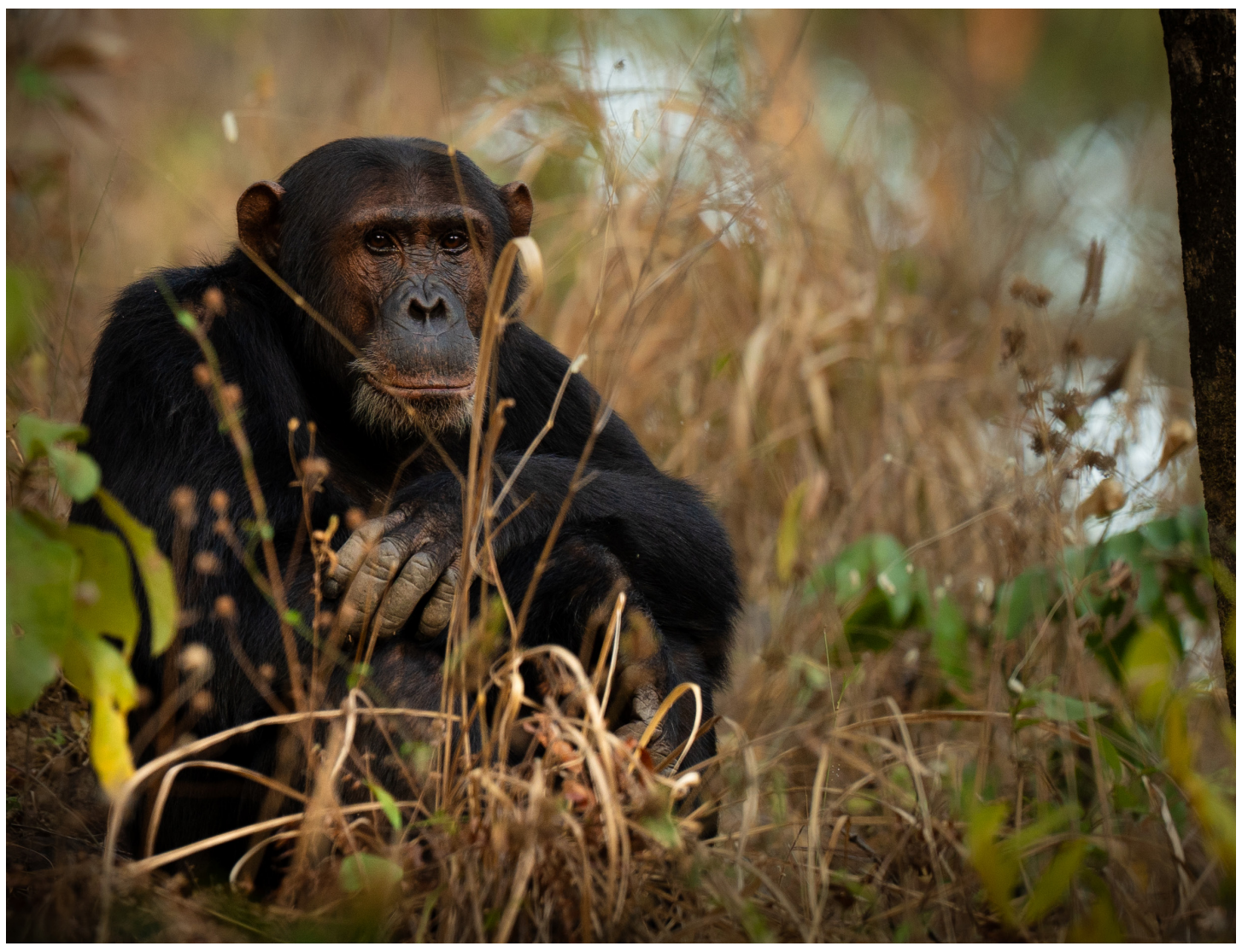
From its grassy perch, the chimpanzee (Pan troglodytes) gazes toward the labyrinthine riparian forest below. A small group of humans struggle to navigate through the vines tangle that harass their legs with every step, while the steep slope quickly exhausts their stamina – a stark contrast to the chimpanzee's seemingly effortless quadrupedal meander through the same terrain moments earlier. While bipedalism appears so uniquely unsuited to the landscape at Issa Valley (Tanzania), there is evidence to suggest that Ardipithecus ramidus, an early hominin, was bipedal in a similar habitat 4.4 million years ago.