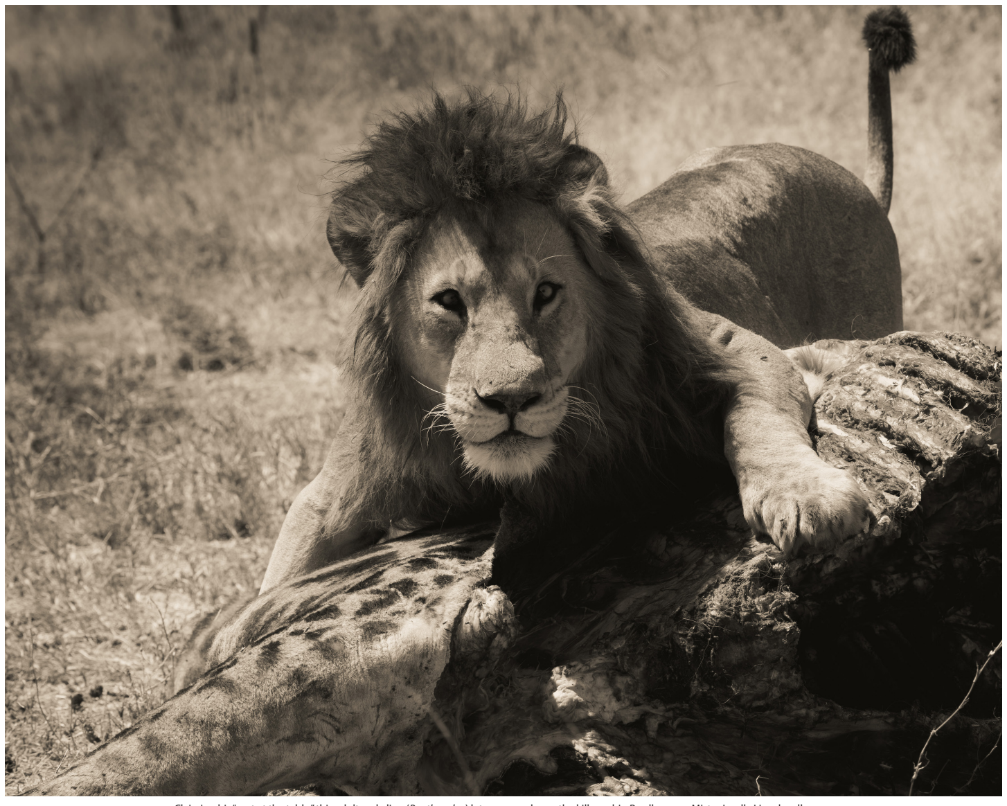
Claiming his "seat at the table," this adult male lion (Panthera leo) let everyone know the kill was his. By all means, Mister Lordly Lion, by all means.