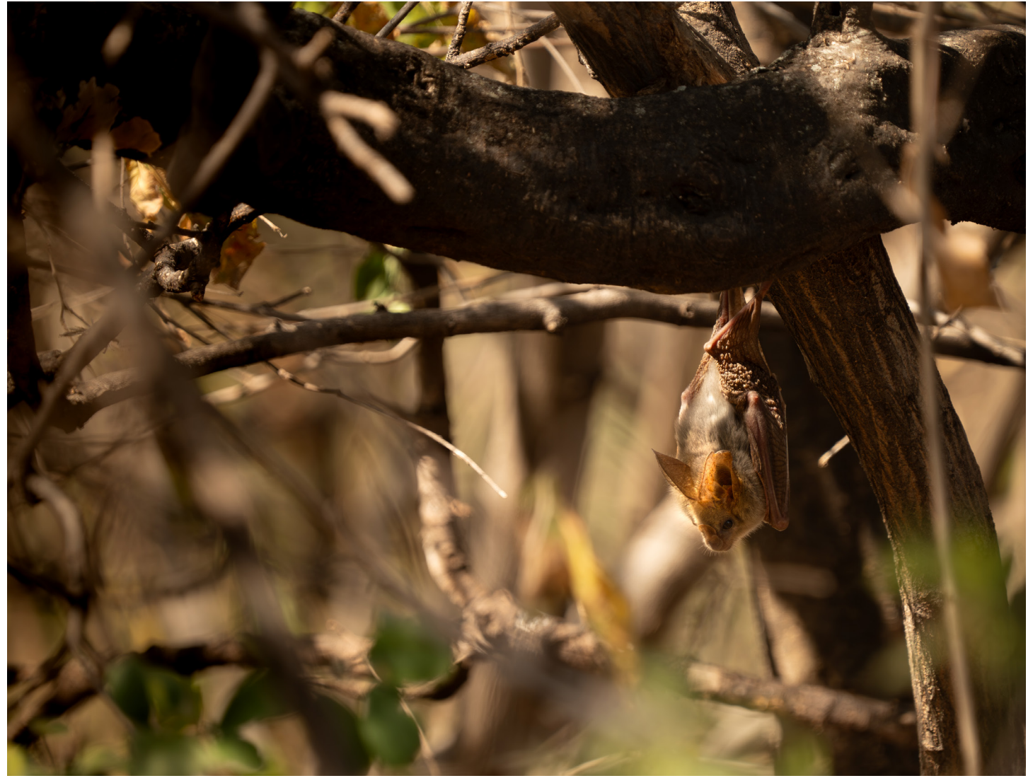
No one likes having their sleep disturbed, and this horseshoe bat was particularly aggrieved to be woken in the middle of the day when a group of humans peeked into the a hollow of a baobab tree where it was resting. Annoyed, the little bat flittle to a nearby branch and glowered at the rude bipeds.