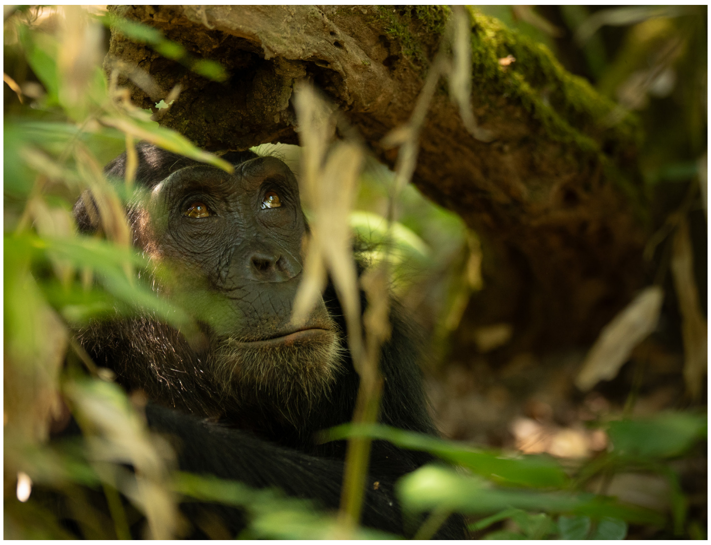
In a moment of serenity on the jungle floor, this chimpanzee (Pan troglodytes) watched as other members of its community clambered in the forest canopy of Mahale Mountain National Park, Tanzania.