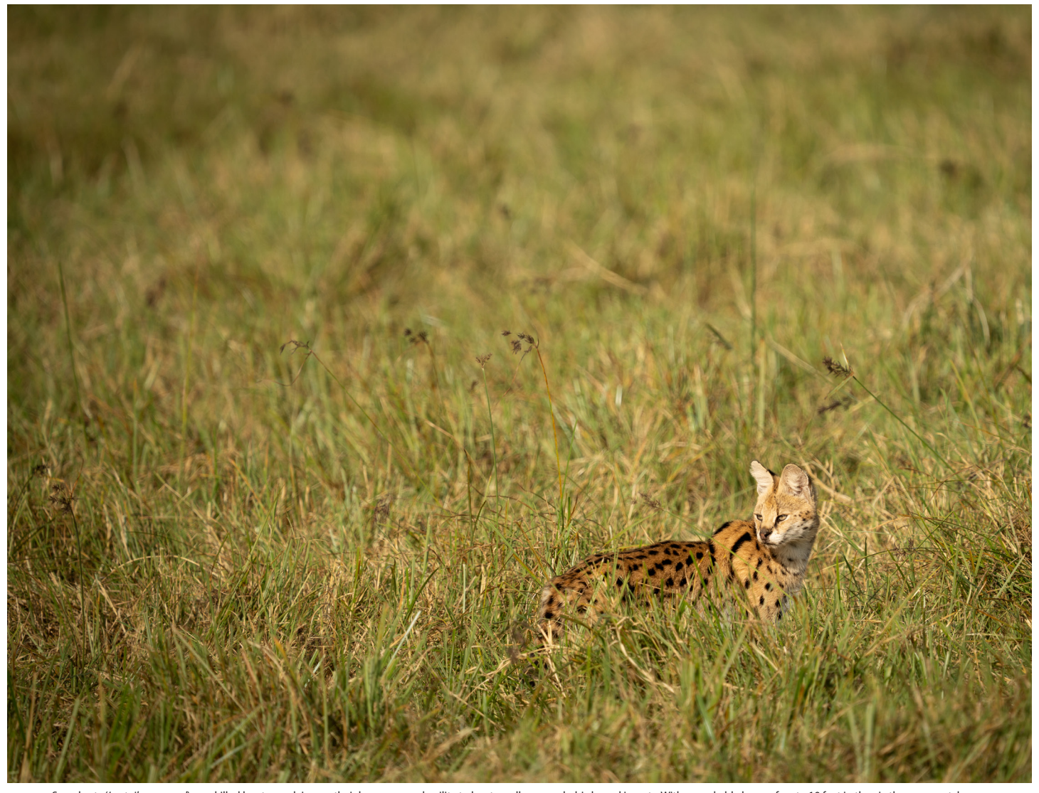
Serval cats (Leptailurus serval) are skilled hunters, relying on their large ears and agility to hunt small mammals, birds, and insects. With remarkable leaps of up to 10 feet in the air, they can snatch prey with precision. Although primarily nocturnal, they will hunt during the day if unsuccessful the night before, as was observed at Ngorongoro Crater (Ngorongoro Conservation Area, Tanzania).