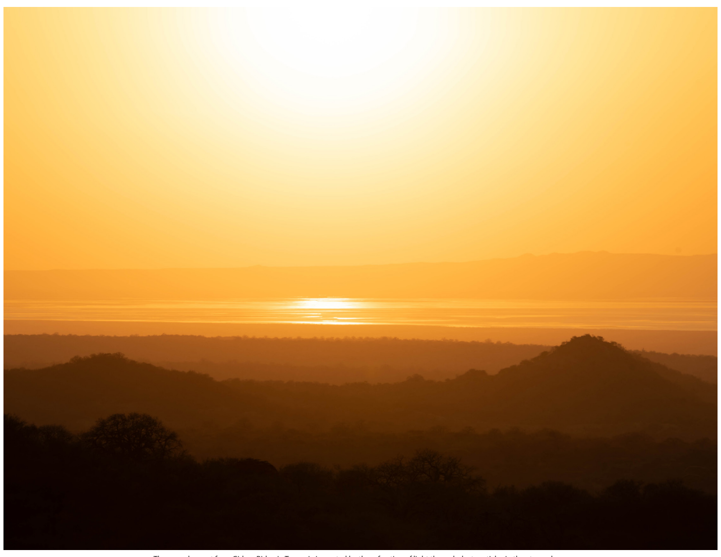
The surreal sunset from Gideru Ridge in Tanzania is created by the refraction of light through dust particles in the atmosphere. In Tanzania, the soil is rich in iron oxide, which gives it a reddish hue, and enhances the vibrant oranges, reds, and yellows that paint the sky at dusk.