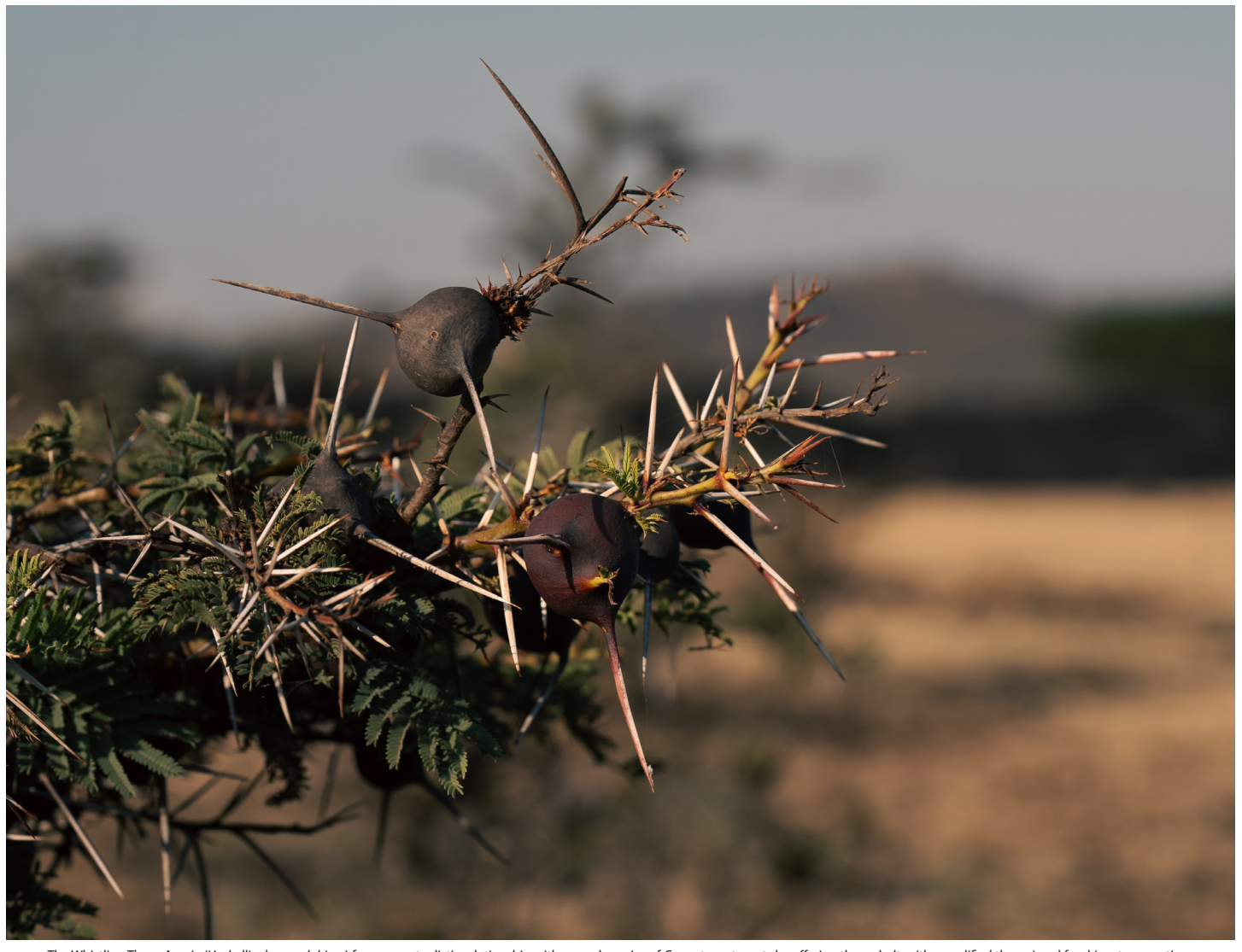
The Whistling Thorn Acacia (Vachellia drepanolobium) forms a mutualistic relationship with several species of Crematogaster ants by offering them shelter (the modified thorns) and food (nectar secretions and beltian bodies at the tips of the leaves) in exchange for protection from herbivores. The ants fiercely defend the tree and attack any threat, insects and mammals alike.