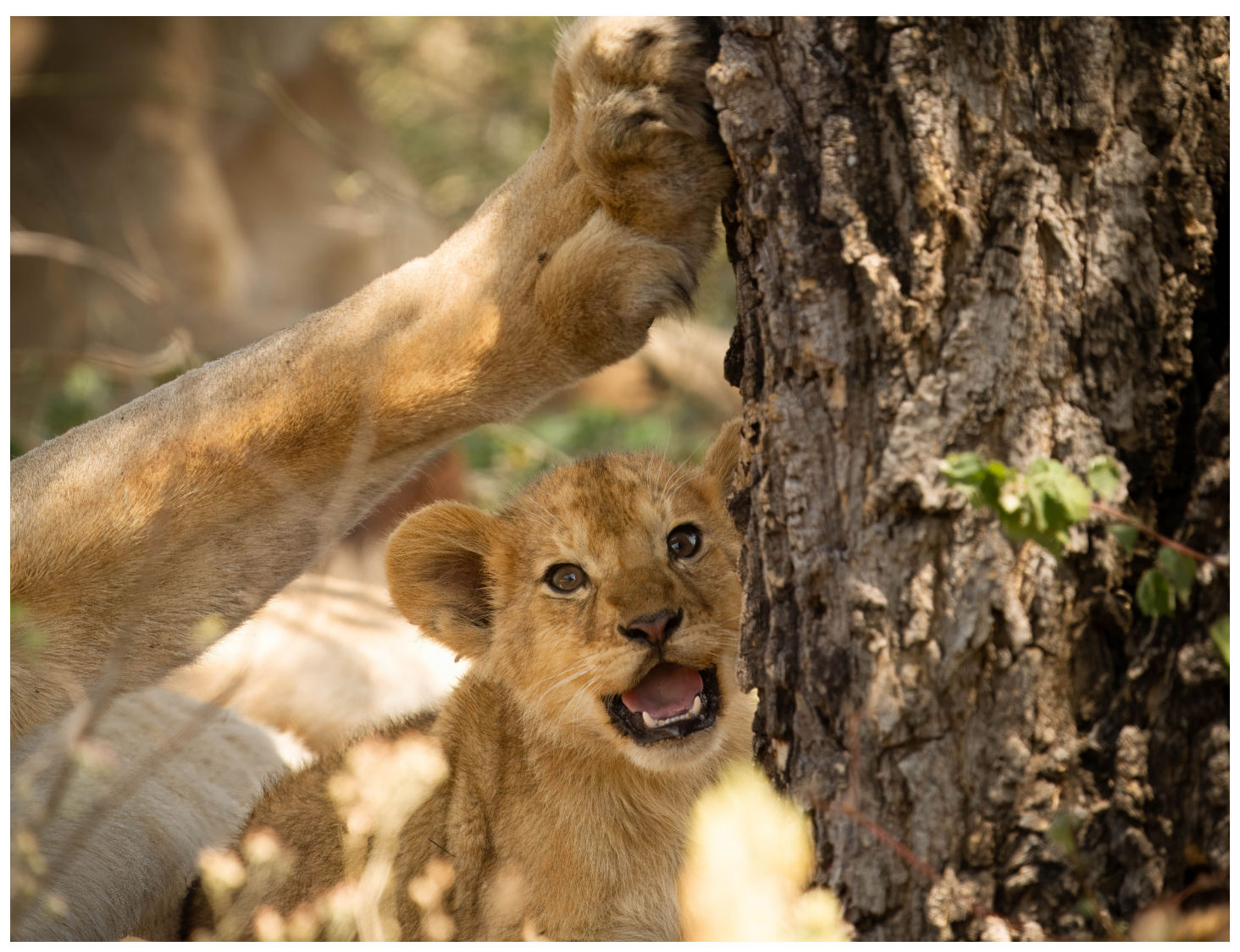
This happy chap enjoys days filled with play with other lion cubs, nursing from mom (or even other lactating lionesses), exploring the wonders of Tanzania's Serengeti, and learning the fine art of hunting.