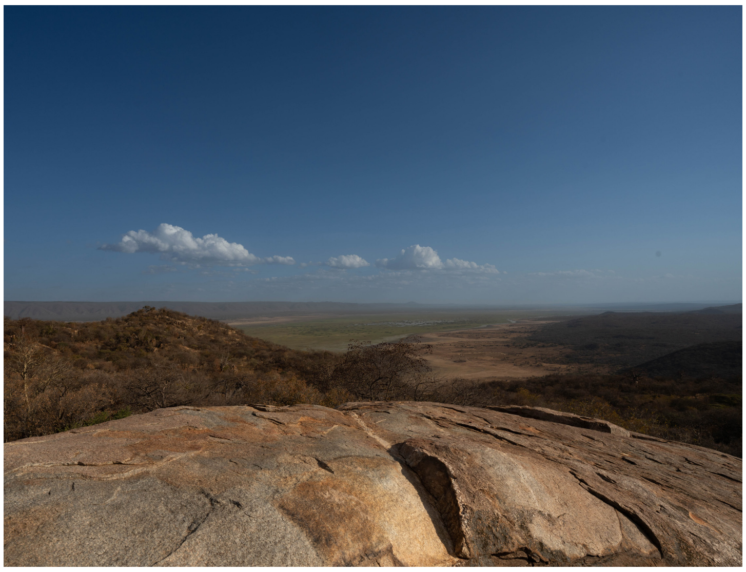
The southward view of Yaeda Valley from a massive boulder atop Gideru Ridge in Tanzania, taken in late July, reveals the dry season in full force, slowly encroaching on the remaining oases of water in the valley. Rain won't return until November, when the first of Tanzania's two wet seasons begins.