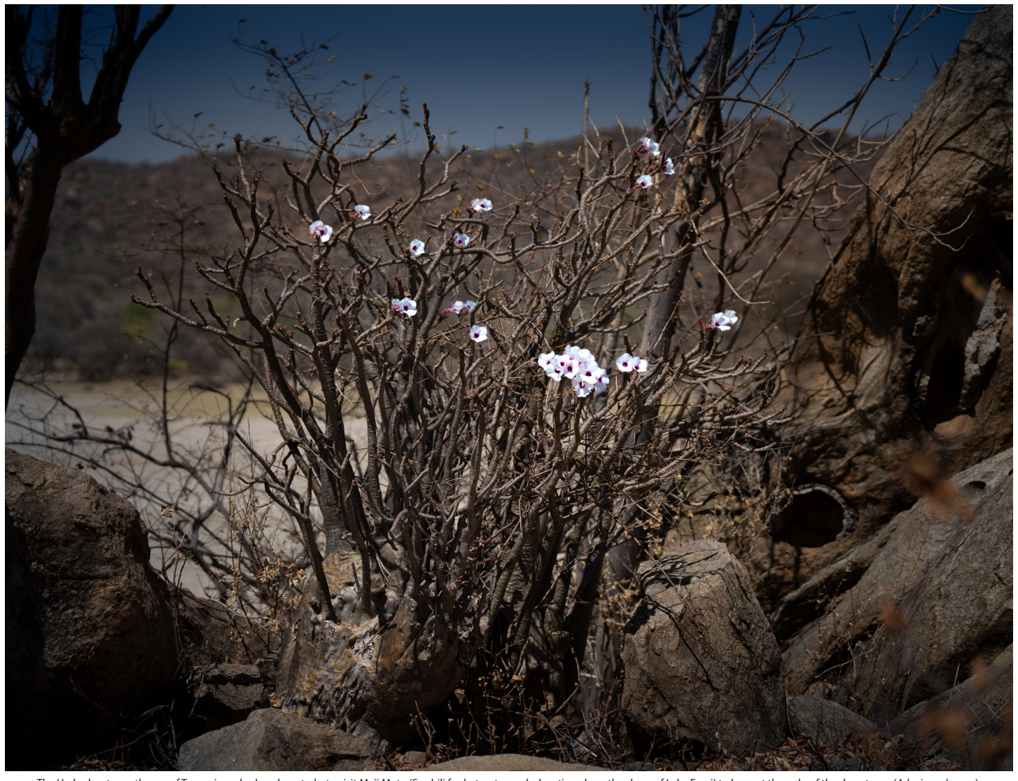
The Hadza hunter-gatherers of Tanzania embark on long treks to visit Maji Moto (Swahili for hot water, and a location along the shore of Lake Eyasi) to harvest the pulp of the desert rose (Adenium obesum). When boiled into a thick tar, this pulp, rich in potent cardiac glycosides, becomes a lethal poison that the Hadza use to coat their arrows for hunting big game.