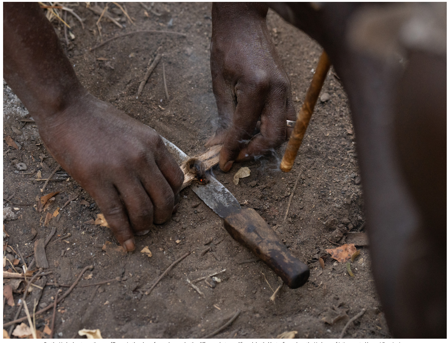
For the Hadza hunter-gatherers of Tanzania, the glow of an ember can be the difference between life and death. Master fire makers, the Hadza use friction created by rapidly spinning the end of a prepared stick or arrow shaft (acting as a spindle) with downward pressure on a wooden base to generate enough tinder (wood powder) and heat to cause ignition.