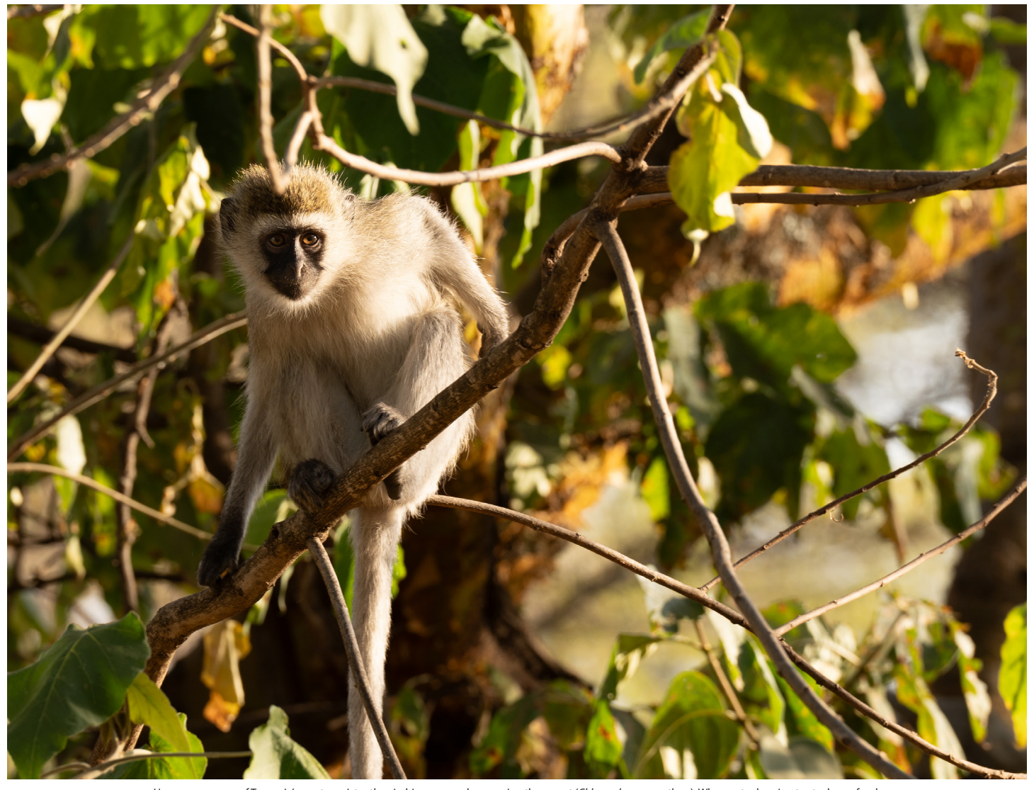
Here, you see one of Tanzania's most persistently mischievous monkey species: the vervet (Chlorocebus pygerythrus). When not scheming to steal your food, you might find yourself captivated by their intense stares, the striking turquoise and red genitalia of the males, and their complex social structures. Vervets communicate through a sophisticated system of vocalizations and facial expressions, highlighting their remarkable adaptability and social cohesion.