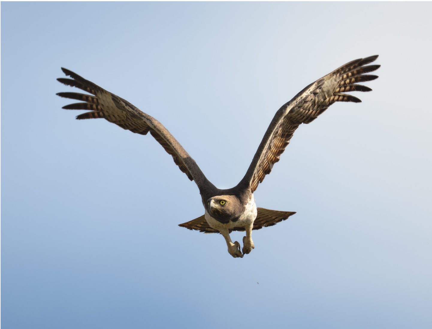
The powerful wings of this martial eagle ( Polemaetus bellicosus ) create immediate lift and speed as it launches from its perch. The largest of the African eagles with wingspans up to 1.9-2.6 m (6.2-8.5 ft), the martial eagle is an apex aerial predator capable of taking down large prey, such as antelope and livestock. But size and ability come at the cost of slow reproduction as a single egg must be incubated for 45 days and fledging is much delayed (~three months), followed by years of dependence. Seronera, Tanzania.