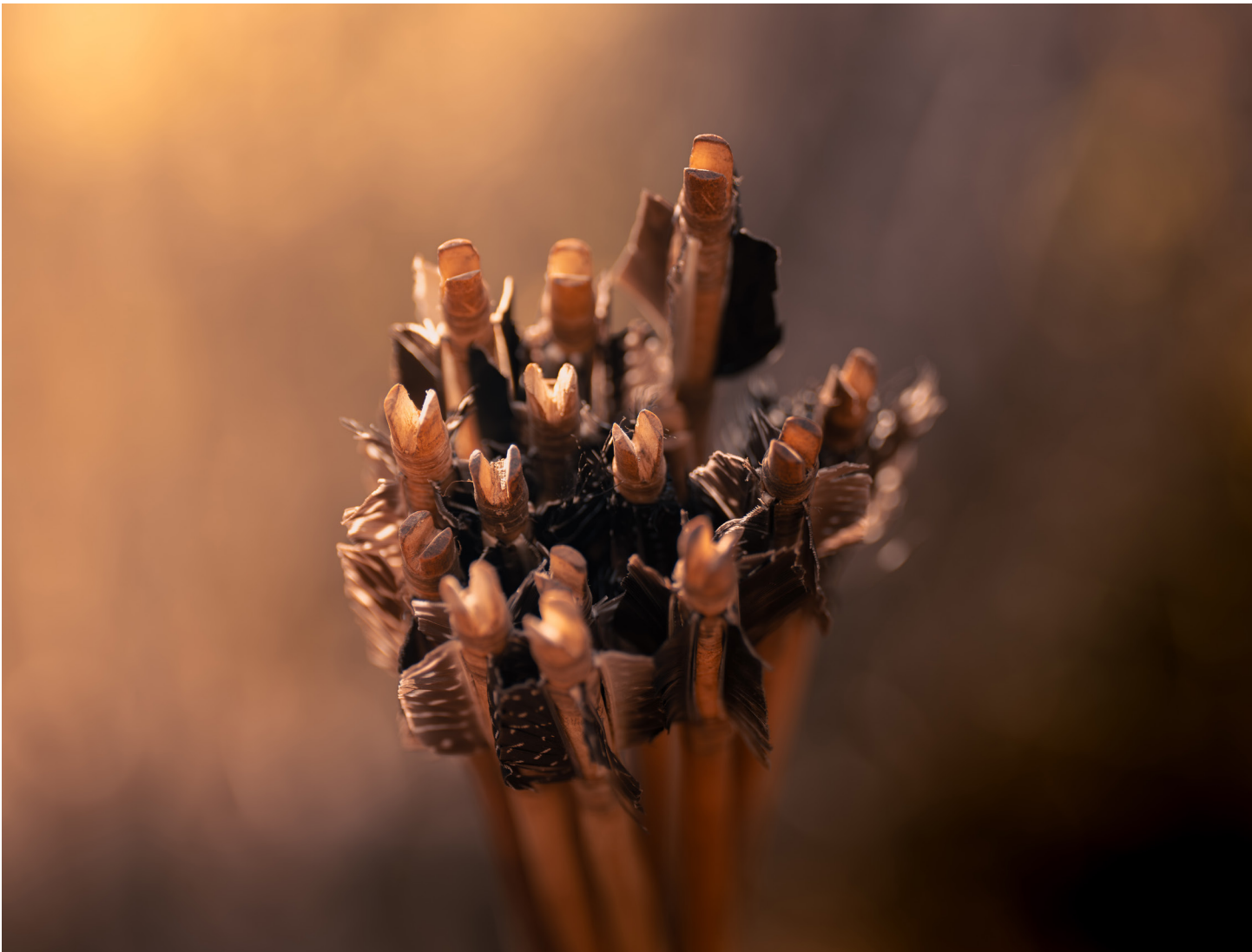
This bundle of arrows showcases the crafting mastery of the Hadza foragers of Tanzania. The arrow shafts, made from white crossberry ( Grewia tenax ) branches, are whittled, heat-treated, and straightened into durable projectiles. The tips range in form and function: simple tapered wooden points for small game, cold-forged metal arrowheads adorned with poison for large and dangerous animals, and blunt percussive bulbs for stunning birds. The fletching is southern crested guinea fowl ( Guttera edouardi ), or other bird feathers, and affixed with chewed animal sinew to stabilize the flight of the arrow. Yaeda