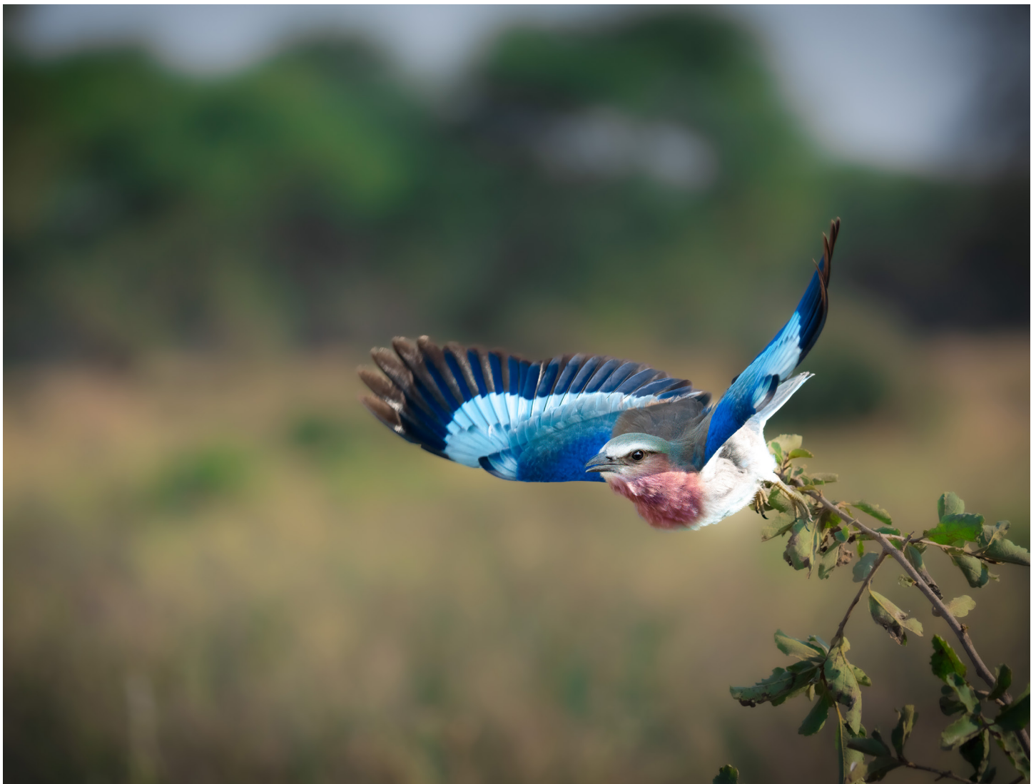
In a burst of iridescent blue and violet, the lilac-breasted roller ( Coracias caudatus ) launches from its perch to swoop to the ground to capture a dung beetle ( Catharsius gorilla ). The lilac-breasted roller is one of Africa's most colorful birds and is so named for their dramatic rolling dives performed during courtship. Tarangire National Park, Tanzania.