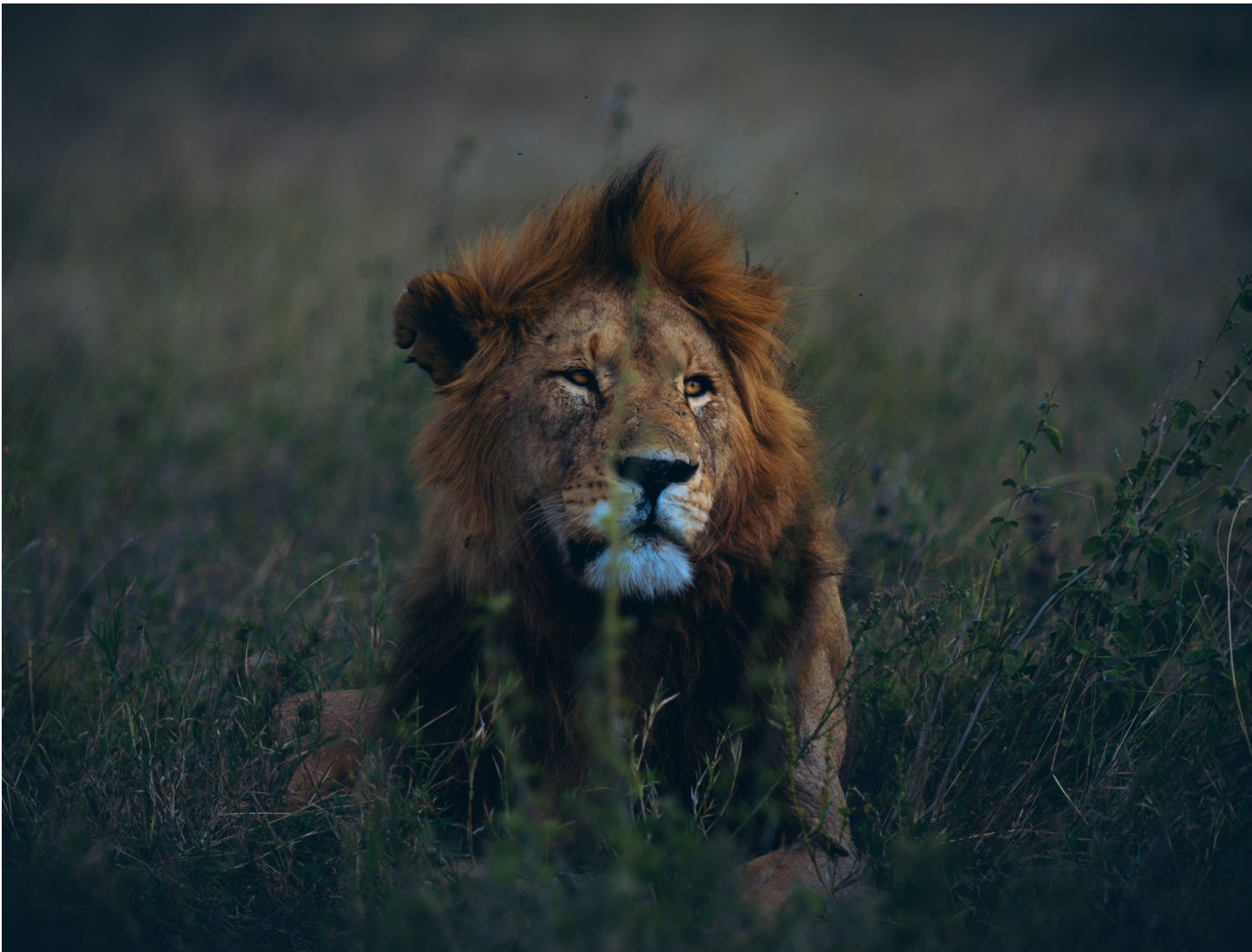
This stately lion's ( Panthera leo ) captivating presence makes one wish to see the world through his eyes. What might we learn about the world we share and, perhaps, ourselves as drivers of ecosystem change? The mane of male lions is an epigamic trait (honest signaling of mate quality) as it reflects age, health, and testosterone level. Seronera, Tanzania.