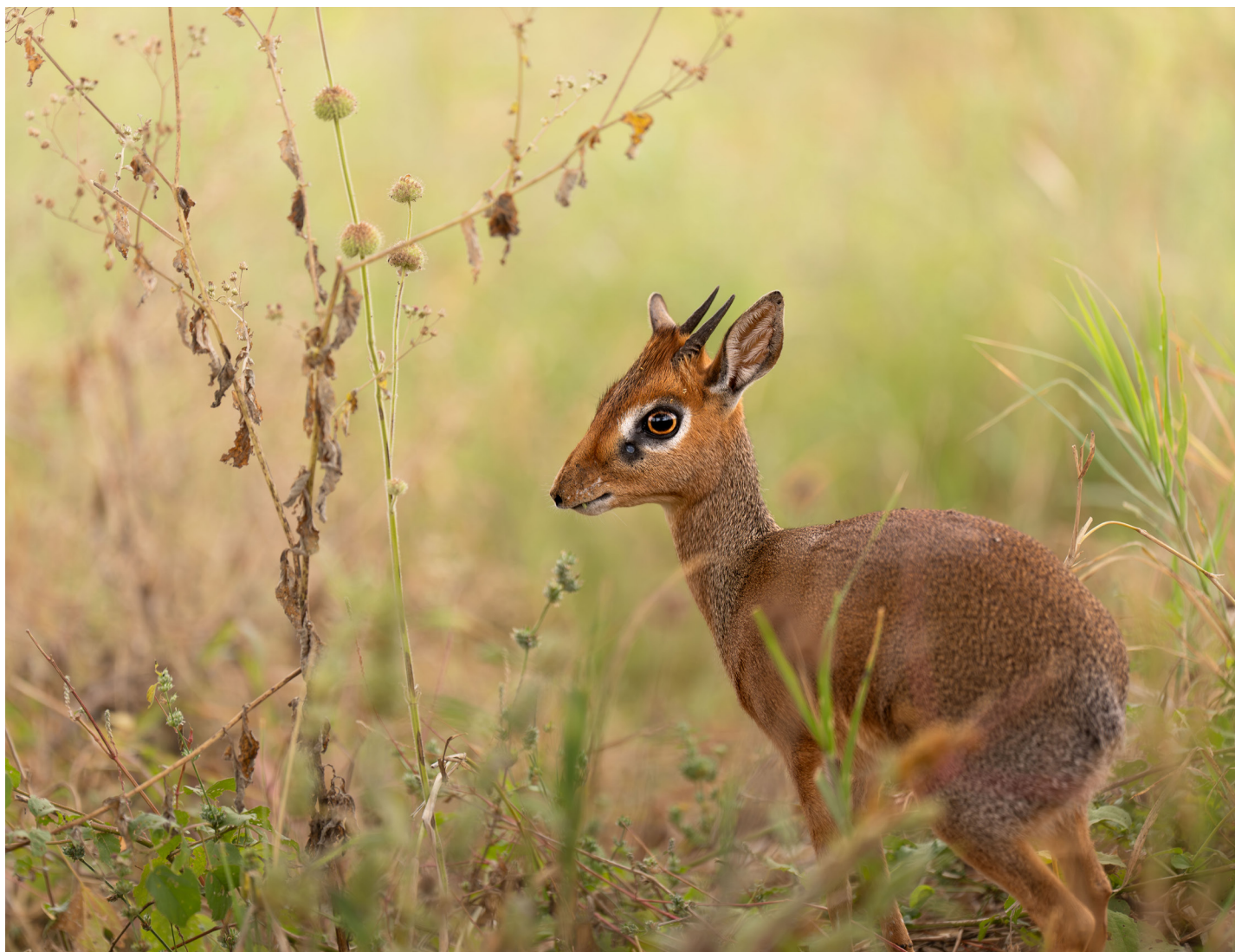
The Kirk's dik-dik ( Madoqua kirkii ) is one of Africa's most remarkable antelopes. They are tiny—30-40 cm (12-16 in) tall and weigh 3-6 kg (6.5-13 lbs). Yet they extremely nimble and can reach speeds up to 42 kmh (26 mph) to avoid predators. They mate monogamously and maintain small, well defined territories. They are also adapted to arid conditions: their specialized nasal cavity functions like a natural cooling and moisture-recycling system and they concentrate and dehydrate urine and feces to conserve water. Tarangire National Park, Tanzania.