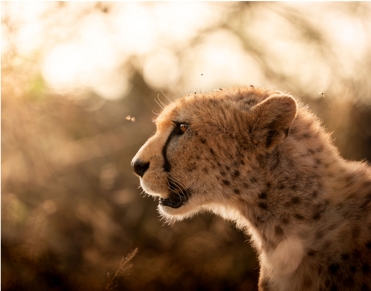
Cheetahs ( Acinonyx jubatus ) are the fastest land animal, reaching speeds of 113 kmh (70 mph), but also make fantastic photography subjects when still. Perhaps it is the ever-present slightly worried expression they wear that makes them seem relatable? Most individual mega-mammals in Africa are themselves “archipelagoes” for countless insects, other invertebrates, and microbes. Ndutu Lake, Tanzania.