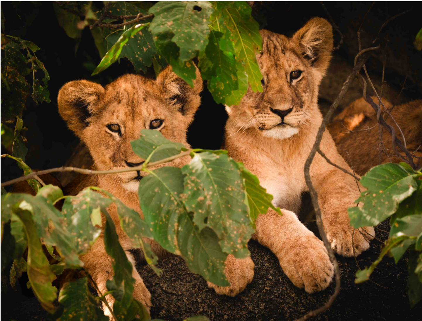
Hidden and protected by foliage, this collection of lion cubs ( Panthera leo ) had no adult supervision. Lionesses, as primary providers, must balance care of their cubs with survival needs and will park them in secluded spots to minimize detection while hunting. Leopards and spotted hyenas have been known to prey on lion cubs. Seronera, Tanzania.