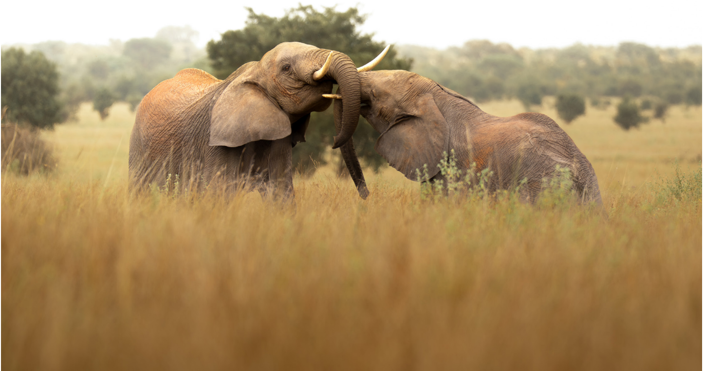
Two young elephants ( Loxodonta africana ) engage in a friendly sparring match. Such duels, though seemingly playful, are vital for developing strength, skills, and social hierarchies. Tarangire National Park, Tanzania.