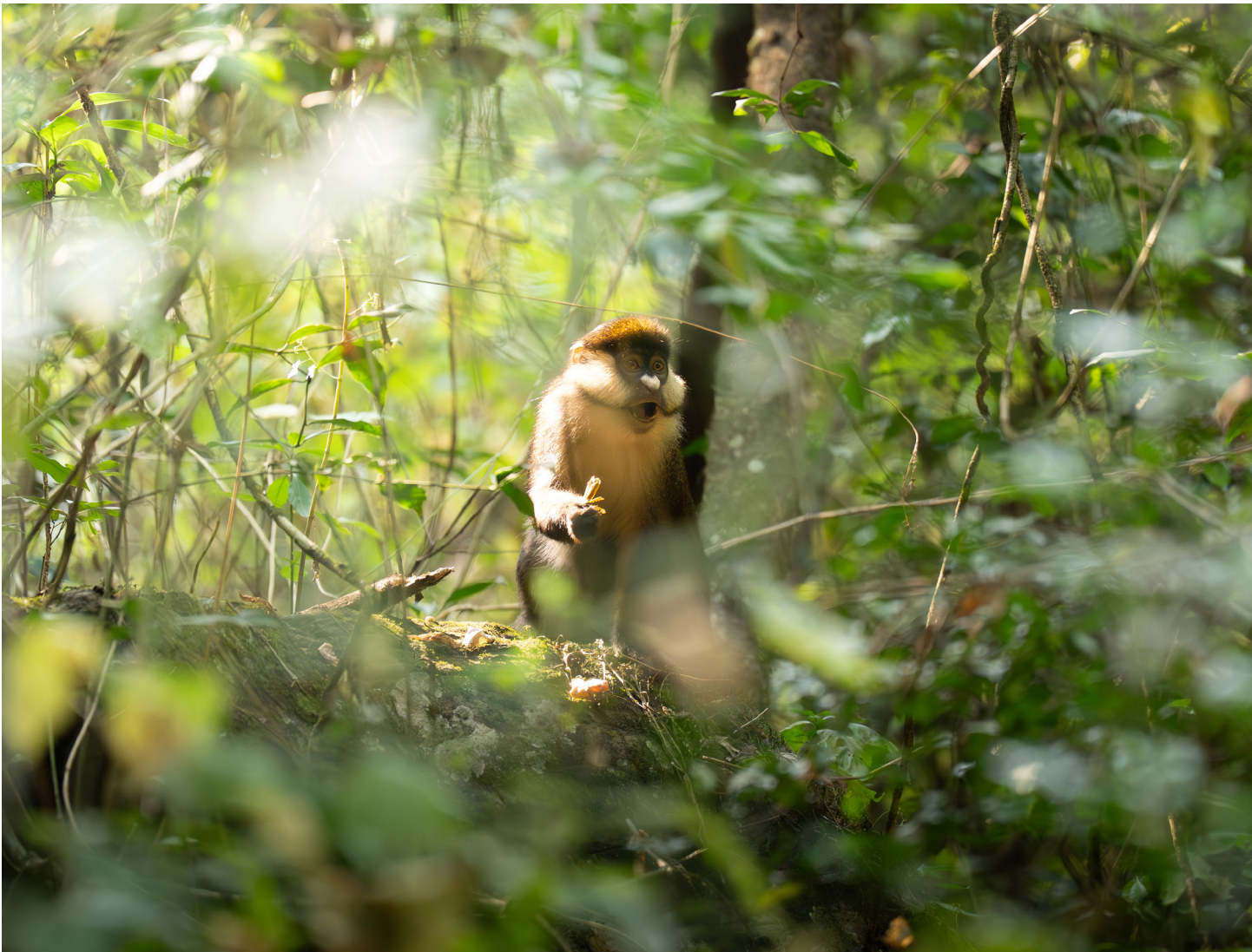
Agile, curious, and an expert at foraging for edible plants and insects, this red-tailed monkey ( Cercopithecus ascanius ) was captured in a moment of exaltation and magical illumination. Issa Valley, Tanzania.