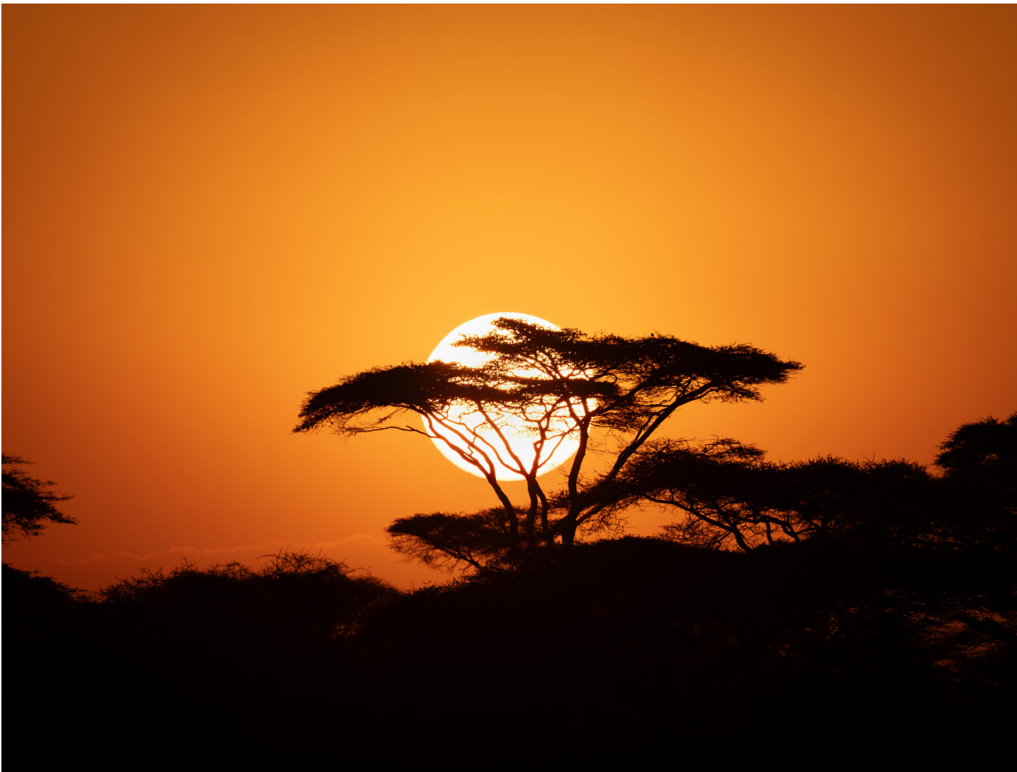
Only in equatorial Africa does the setting sun illuminate the sky in such dramatic fashion. As the sun lowers, its light rays must travel a long atmospheric path, which causes Rayleigh scattering, in which blue light is refracted, leaving mostly red and orange wavelengths. Iron oxide particles from Tanzania's soil, along with smoke and other fine particulate matter, contribute to the epic light. Ndutu Lake, Tanzania.