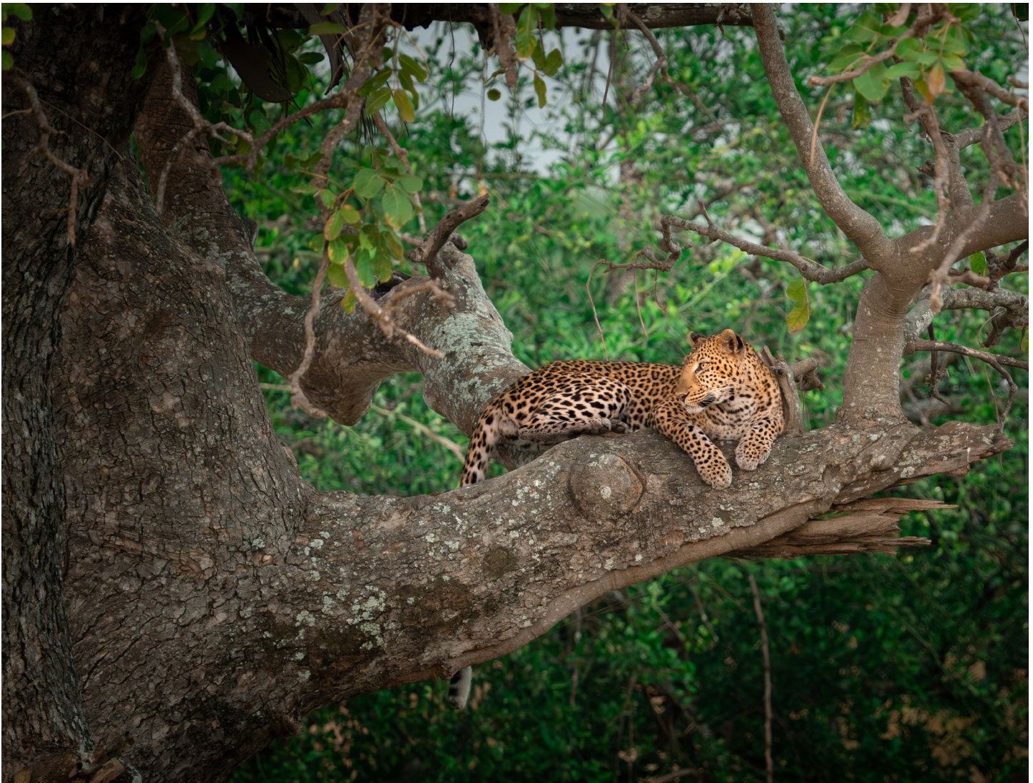
Leopards ( Panthera pardus ) embody the mastery and strength of solitary hunters. Their authority is evident when resting effortlessly upon the limb of a sausage tree ( Kigelia africana ), like this, or when hoisting prey far bigger and heavier than itself onto high branches to safeguard from scavengers. Tarangire National Park, Tanzania.