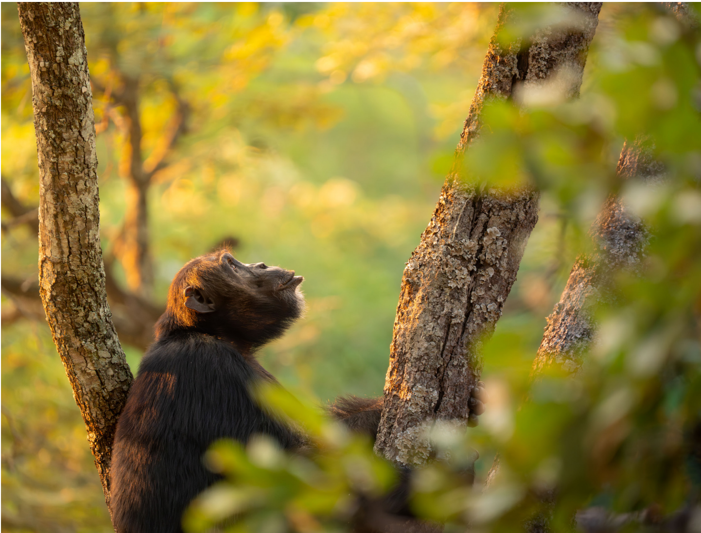
Chimpanzees ( Pan troglodytes ) greet the day with piercing “pant-hoots”—a vocalization performed during inhale and exhale that rises from barely audible to a raucous crescendo. Issa Valley, Tanzania.